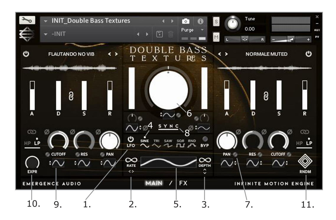
*IME SUPPORTS CC LEARN. RIGHT-CLICK A MIDI CONTROLLER KNOB OR FADER TO ASSIGN IT.